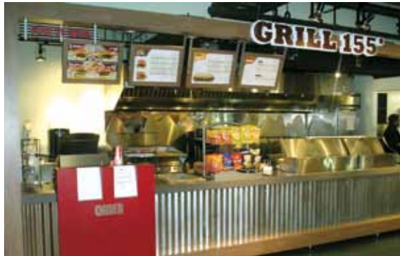
Above: Before and after at Marina: The air conditioned dining hall serves up views and an array of flavors.