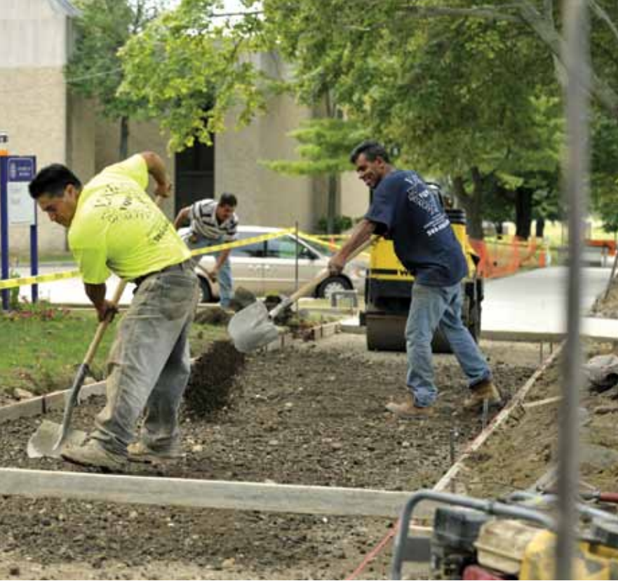
Facelift: Crews replaced walkways and created lush open spaces throughout campus.