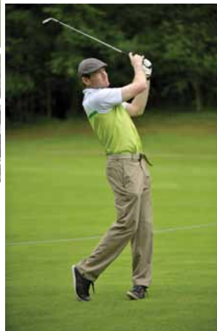
Eye on the ball: one of the 120 participants who took a swing for UB athletics.