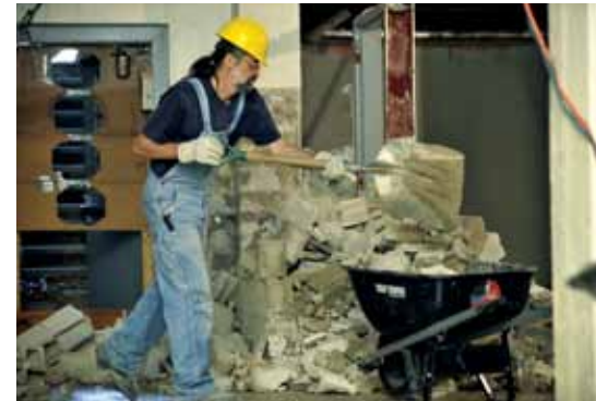
The Human Anatomy Lab at Eleanor Dona Hall was demolished then rebuilt with new scrub areas, large-screen monitors, and virtual dissection stations.